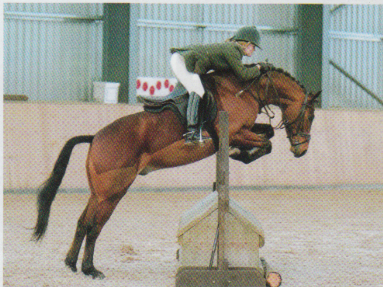
An example of the Pincus pony breeding program - Tyn-y-Cae Sandmartin (by Wurlitzer) who won the Evaluation Series for dressage as a four year old and is here jumping as a five year old.